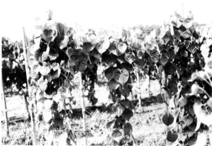
FIGURE 1.—Mature vines of Dioscorea esculenta .

length is a varietal characteristic. Each stolon bears only one terminal tuber. About 4 to 20 tubers are borne by each plant. The number of tubers increases with favorable growth conditions, but is also related to the variety. The tubers vary in diameter from the size of a stolon to 20 centimeters in exceptional cases. In the Caribbean, tubers average 8 to 10 centimeters in length, with a diameter of 2.5 to 5 centimeters and a weight of 100 to 200 grams. Small tubers, useful as seed, are common. Very large tubers (as in the case of New Guinea varieties) reach 3 kilograms.