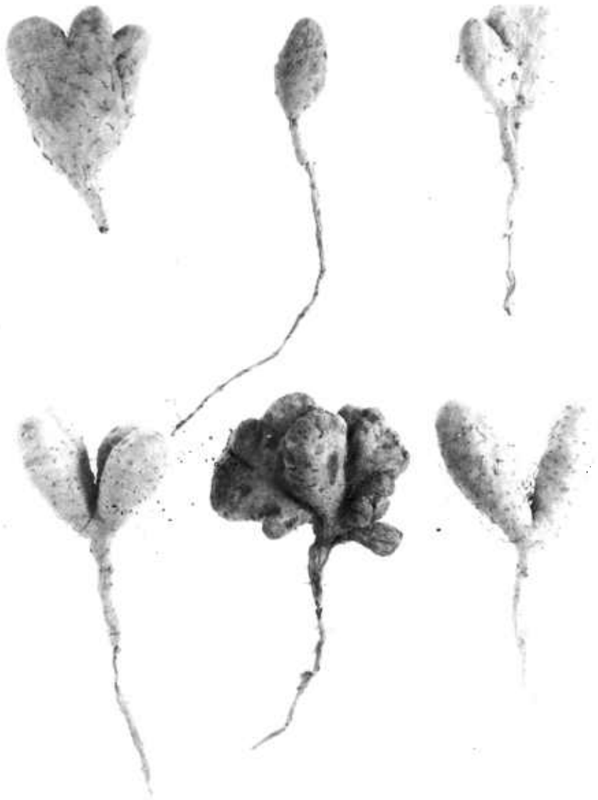
FIGURE 4.—Unusual tuber shapes of the lesser yam.