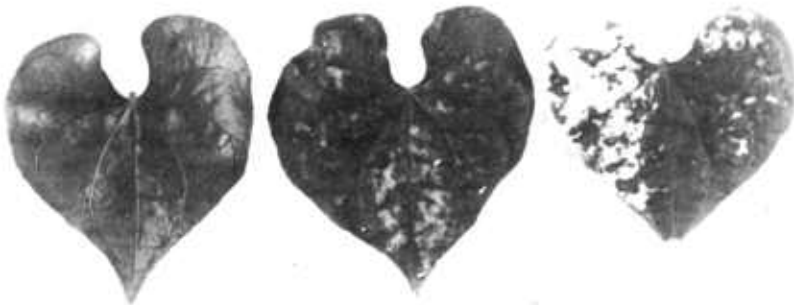
FIGURE 7.—Normal lesser yam leaf (left) and two leaves affected by mosaic virus disease.

Because of the very succulent and fragile nature of the tubers, extreme care must be taken to remove the tubers from the ground. This is normally done with hand tools, but commercial potato-digging devices can be used also. These may damage the tubers if not carefully used. Tubers must be cut from the crown and may then be washed and dried. Damaged tubers should be processed or used up as rapidly as possible.