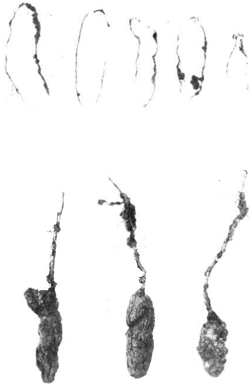
PN-3439 FIGURE 8.—External and internal lesions in lesser yam tubers, associated with nematode damage.