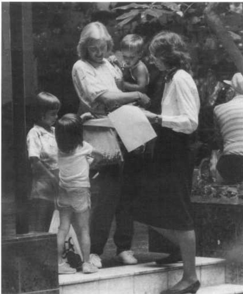
When Campbell Soup Company set out to market a spaghetti sauce in the United States, it conducted surveys, such as this one in a shopping mall, to find out what consumers wanted.

Marketing uses as many of these aspects as possible to differentiate the product and answer a consumer's need. When Campbell Soup Company set out to market a spaghetti sauce in the United States, it asked consumers what they wanted. When consumers said they wanted a product that tasted "homemade," the