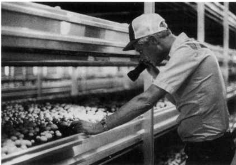
Campbell Soup Company combined American-made equipment with mushroom technology from Holland for its newest mushroom farm in Hillsboro, Texas. Market research determined which mushroom strain would meet consumer preferences. (Ginny Marcin)

company knew that the Chinese valued the time-honored “Campbell” name, but it wanted Chinese consumers to be able to more readily discern what variety they could expect in the can. Campbell produced graphics for each variety, depicting not only the ingredients in the soups but the proportion in which they would be found in the products.